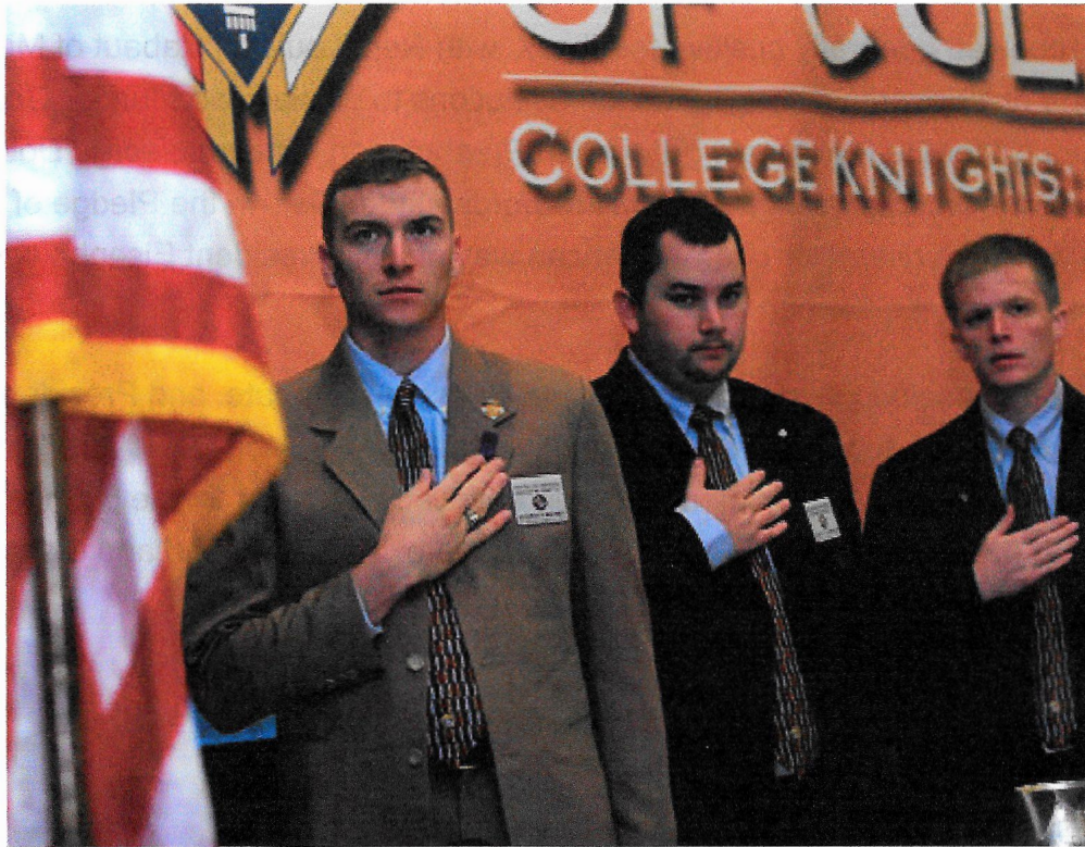
College Knights says the Pledge of Allegiance after the opening benedictions at the College Council Conference, Sep. 22, 2006

The Pledge of Allegiance has undergone several revisions since it was initially written back in 1892 by Baptist minister Francis Bellamy. The last significant change came in 1954 during the midst of the Cold War, when President Dwight Eisenhower signed a congressional resolution adding the words “under God.”